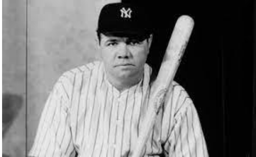
Babe Ruth

BABE RUTH, born George Herman Ruth Jr., was a LEGENDARY (renowned or celebrated) American baseball player. Babe Ruth was born on February 6, 1895, in Baltimore, Maryland. He grew up in a poor family and had a rough childhood. His father worked as a SALOONKEEPER and was unable to provide a stable home for his family. Ruth was the first of eight children born to his parents, and his mother struggled to care for the family. As a child, Ruth was known for his MISCHIEVOUS behavior and was often in trouble.