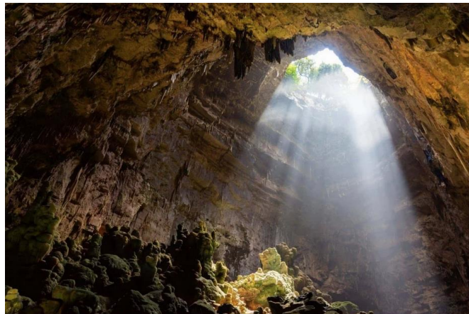
The Castellana Caves in Puglia, Italy.

This is a topography characterized by underground caves and SINKHOLES that form when SOLUBLE (dissolvable) rocks like LIMESTONE or DOLOMITE break down. The caves and sinkholes cause rain to drain away, leaving little to no water above ground.