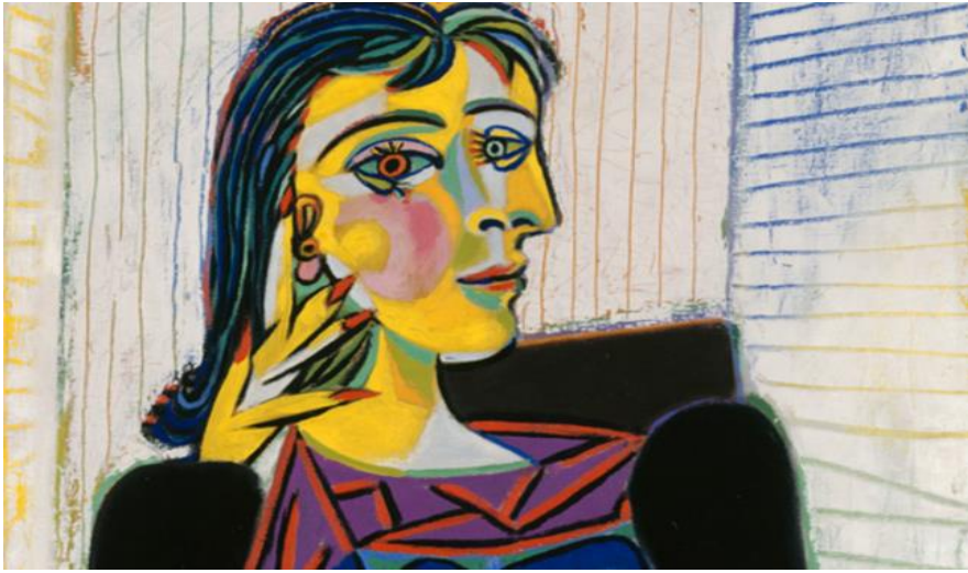
Pablo Picasso, Portrait of Dora Maar (1937)