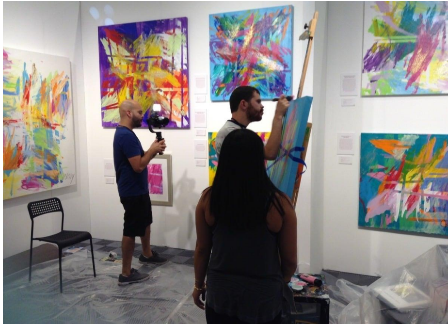
Live Painting Demonstration ART San Diego 2016, Jeremysvision.com